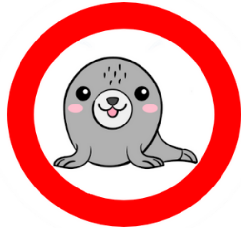
Seal Class (Year 2)