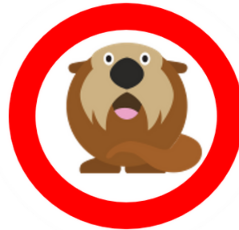
Otter Class (Year 1)