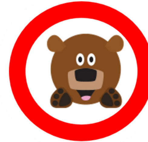
Bear Class (Year 1)