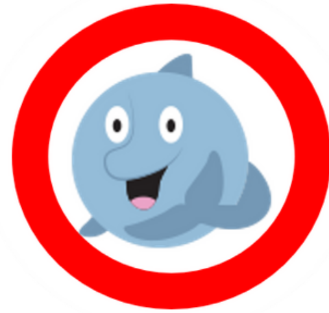
Dolphin Class (Year 2)