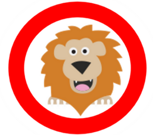
Lion Class (Year 1)