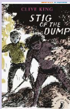
Stig of the Dump by Clive King