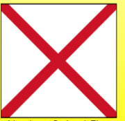
Northern Ireland Flag